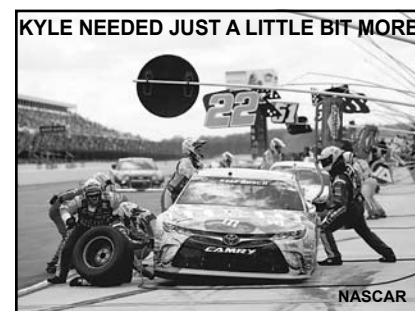
KYLE NEEDED JUST A LITTLE BIT MORE