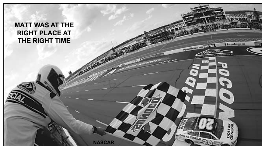
MATT WAS AT THE RIGHT PLACE AT THE RIGHT TIME