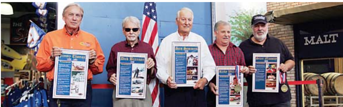
The recipients of the 2016 Georgia Racing Hall of Fame Induction ceremony