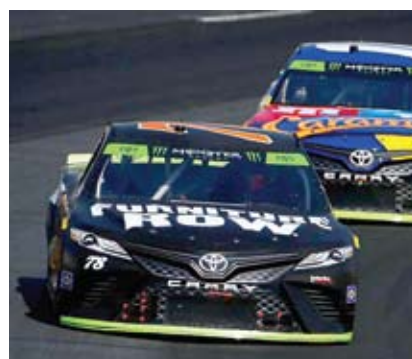
Series Sunoco Rookie of the Year. Driving the No. 77 Furniture Row Racing Toyota, Jones scored a rookie-high five top fives and 14 tops 10s.