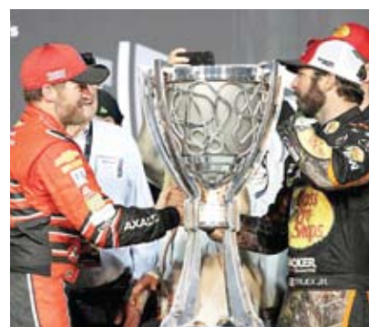
On the strength of 16 victories, Toyota won its second-consecutive Monster Energy Series Manufacturers’ Championship.