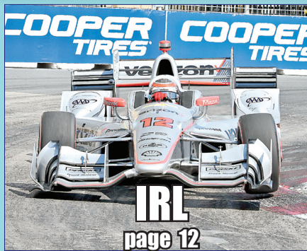
IRL page 12