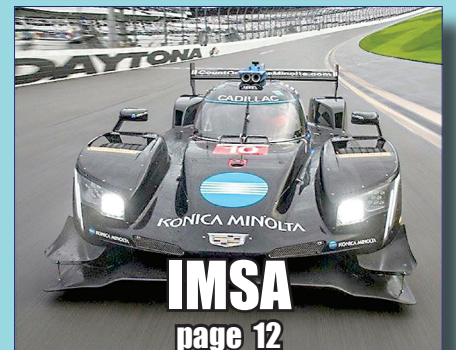
IMSA page 12