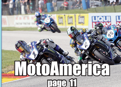
MotoAmerica page 11