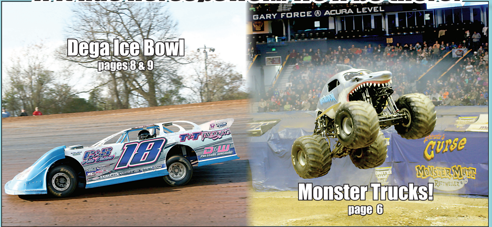
Dega Ice Bowl pages 8 & 9