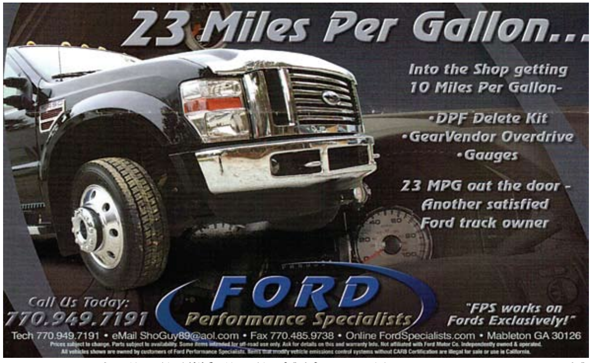
JANUARY / FEBRUARY • 2016 • www.MotorsportAmerica.com • 10