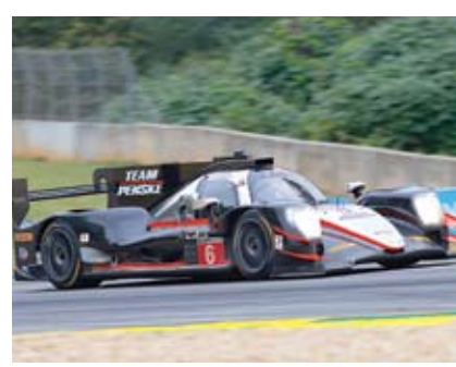
PENSKE COMING TO IMSA IN 2018