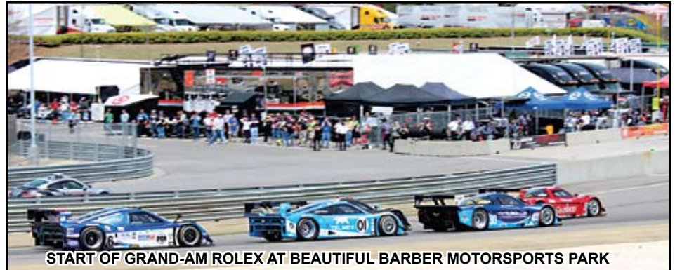
START OF GRAND-AM ROLEX AT BEAUTIFUL BARBER MOTORSPORTS PARK

Also announced today was the extension of the IndyCar contract, bringing the Honda Indy Grand Prix of Alabama back to Barber Motorsports Park for three more years through 2016.