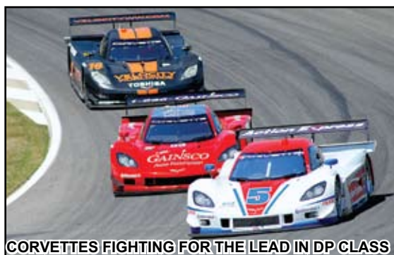
CORVETTES FIGHTING FOR THE LEAD IN DP CLASS