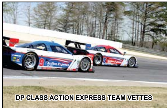
DP CLASS ACTION EXPRESS TEAM VETTES