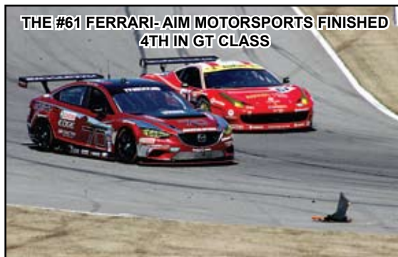
THE #61 FERRARI- AIM MOTORSPORTS FINISHED 4TH IN GT CLASS