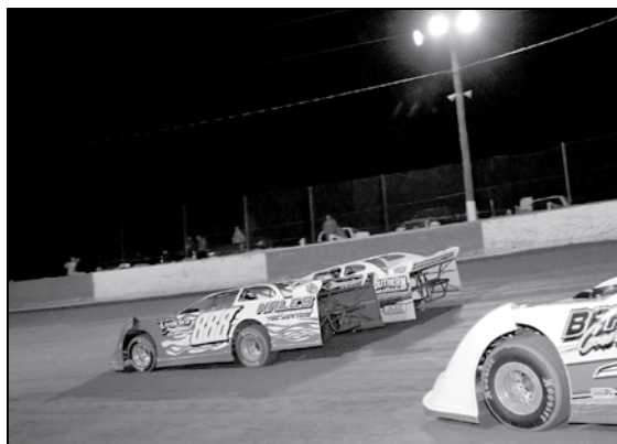
DENNIS HALE FINISHED 5TH