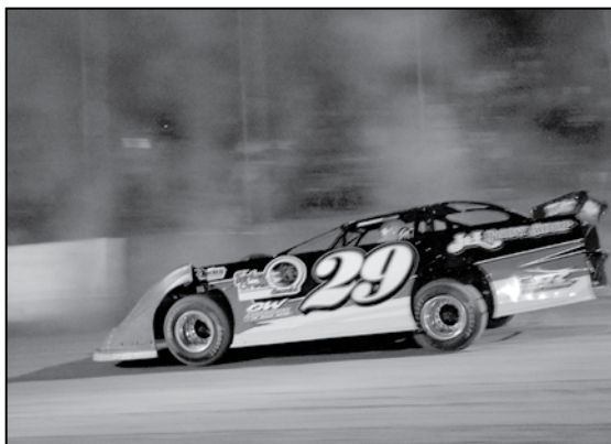
SHANE FULCHER-WIDE OPEN