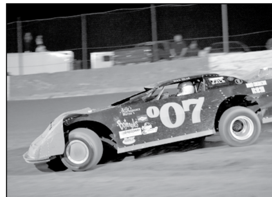
CLIFTON MORAN, B CADET FEATURE