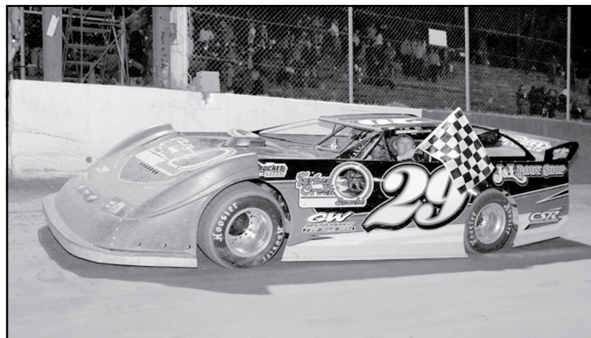
SHANE WINNER OF LATE MODEL FEATURE

The first point race will begin on 12 April for all divisions. On 19 April, in addition to the racing, a special kids Easter egg hunts will held with hundreds of prize-filled Easter eggs. Visit the web site at http://senoiaraceway.com for more details.