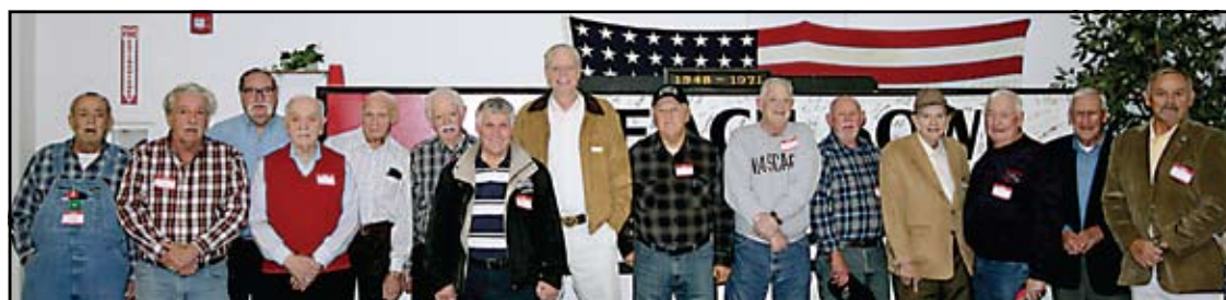
PAST RACERS AT PEACH BOWL SPEEDWAY