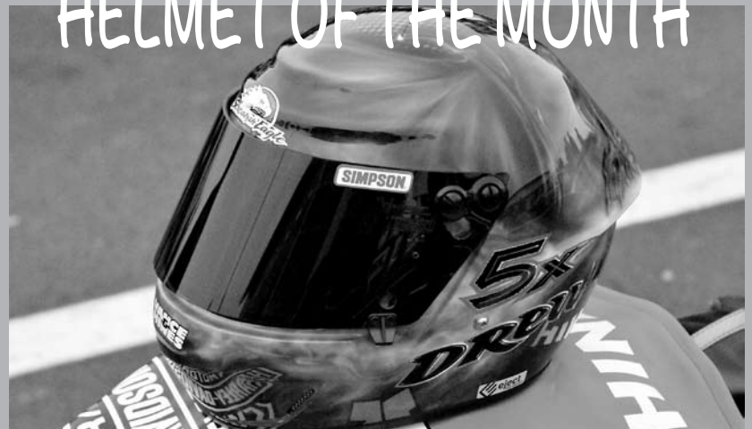
GAINESVILLE WINNER PRO STOCK CYCLE DRIVER EDDIE KRAWIEC