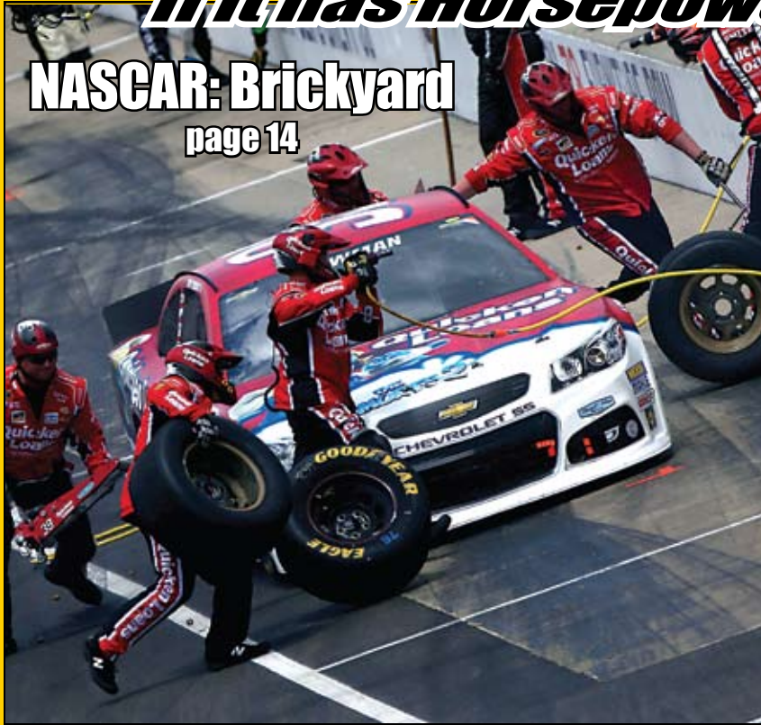
NASCAR: Brickyard page 14