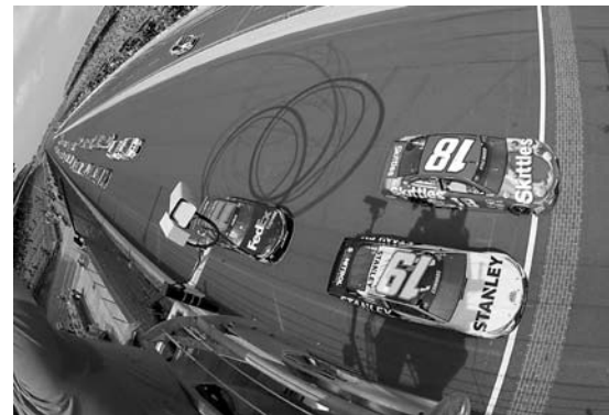
NSCS Green Flag