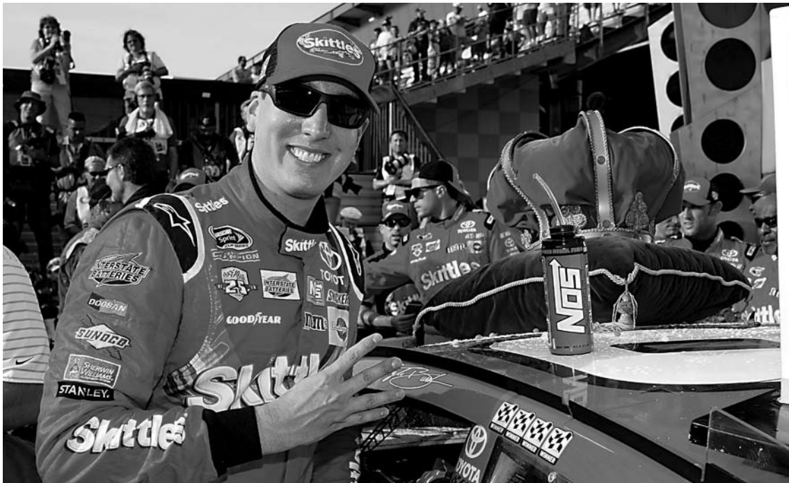
Kyle Busch get a new Winner Sticker