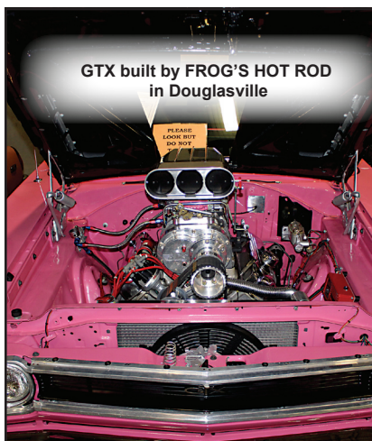
GTX built by FROG'S HOT ROD in Douglasville