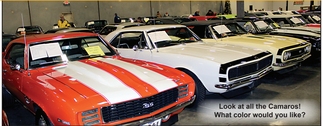
Look at all the Camaros! What color would you like?