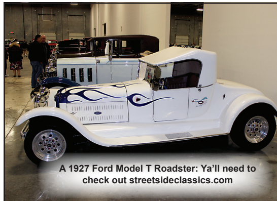
A 1927 Ford Model T Roadster: Ya'll need to check out streetsideclassics.com