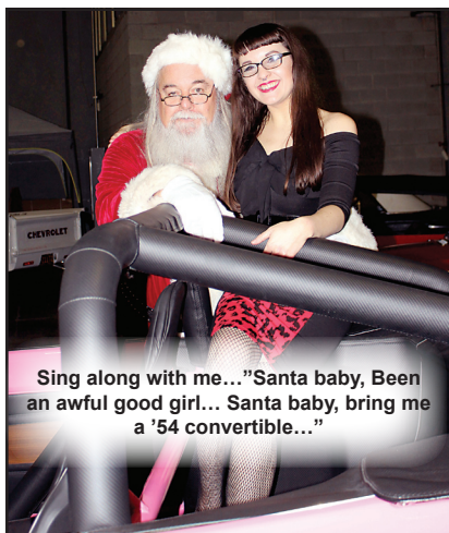
Sing along with me... "Santa baby, Been an awful good girl... Santa baby, bring me a '54 convertible..."