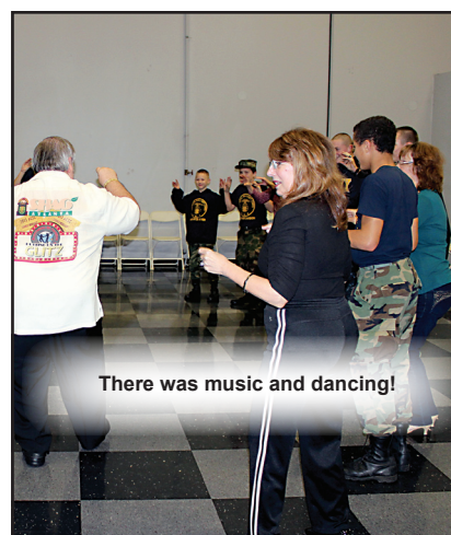
There was music and dancing!