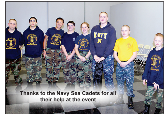
Thanks to the Navy Sea Cadets for all their help at the event