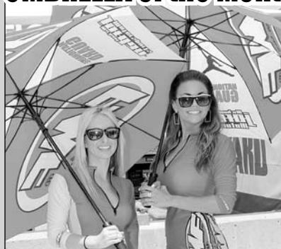
WITH ALL THIS RAIN WE HAD NO HELMET, BUT PLENTY OF UMBRELLAS!