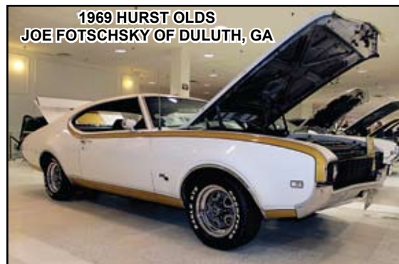
1969 HURST OLDS JOE FOTSCHSKY OF DULUTH, GA