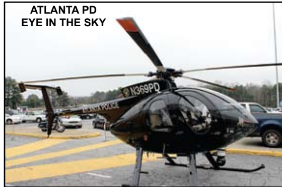
ATLANTA PD EYE IN THE SKY