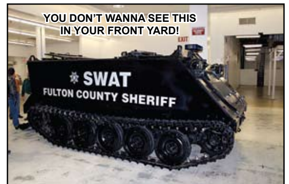
YOU DON'T WANNA SEE THIS IN YOUR FRONT YARD!