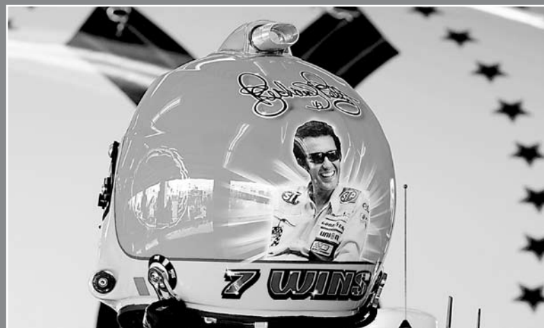
MICHAEL WALTRIP "HONORING THE KING"