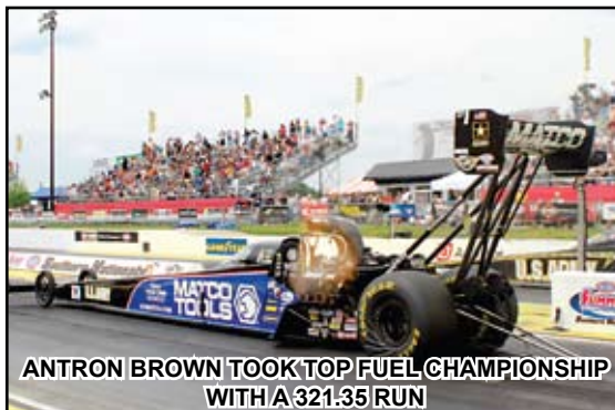
ANTRON BROWN TOOK TOP FUEL CHAMPIONSHIP WITH A 321.35 RUN