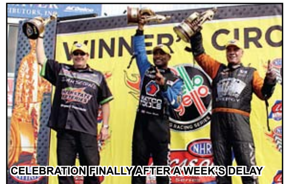
CELEBRATION FINALLY AFTER A WEEK'S DELAY