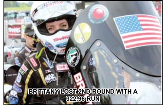
BRITTANY LOST 2ND ROUND WITH A 322.96 RUN