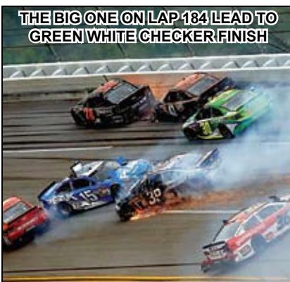
THE BIG ONE ON LAP 184 LEAD TO GREEN WHITE CHECKER FINISH