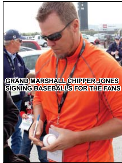
GRAND MARSHALL CHIPPER JONES SIGNING BASEBALLS FOR THE FANS