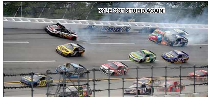
KYLE GOT STUPID AGAIN!