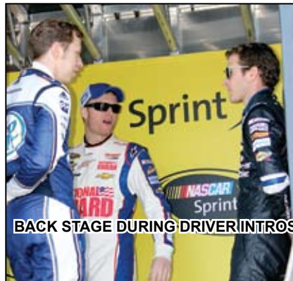
BACK STAGE DURING DRIVER INTROS