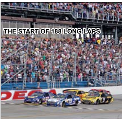
THE START OF 188 LONG LAPS