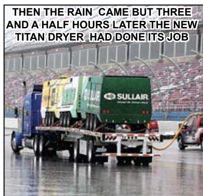
THEN THE RAIN CAME BUT THREE AND A HALF HOURS LATER THE NEW TITAN DRYER HAD DONE ITS JOB