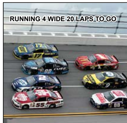
RUNNING 4 WIDE 20 LAPS TO GO