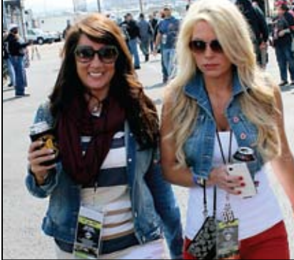
EARLY SIGHTING ON PIT ROW

In the type of stunning victory that has typified racing at Talladega Superspeedway since its inception, David Ragan led an extraordinary 1-2 finish for Front Row Motorsports, which had never won a NASCAR Sprint Cup Series race before Sunday. David Gilliland pushed Ragan, his teammate, to the lead on the final circuit in a green-white checkered-flag finish that took Sunday's Aaron's 499 four laps past its scheduled distance of 188 laps. Gilliland came home second, followed by pole sitter Carl Edwards, Michael Waltrip and series leader Jimmie Johnson.