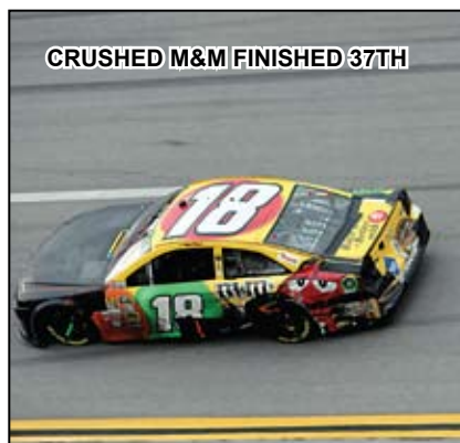
CRUSHED M&M FINISHED 37TH