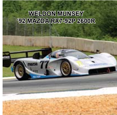
WELDON MUNSEY '92 MAZDA RX7-92P 2600R