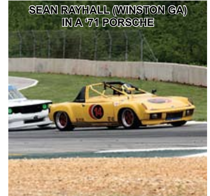
SEAN RAYHALL (WINSTON GA) IN A '71 PORSCHE