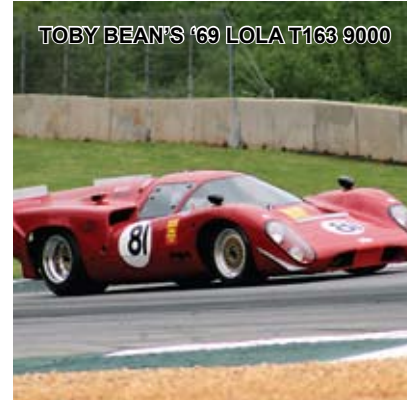
TOBY BEAN'S '69 LOLA T163 9000