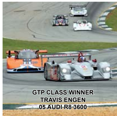
GTP CLASS WINNER TRAVIS ENGEN 05 AUDI R8 3600