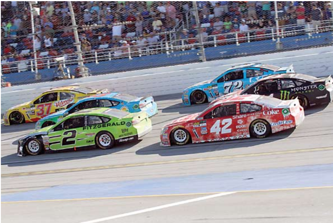
TRYING TO FIND A WAY TO THE FRONT