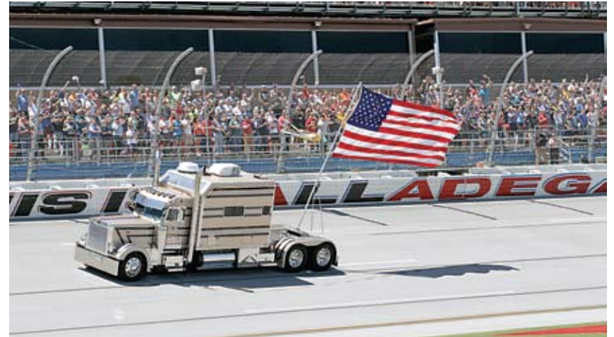
SALUTE TO THE USA