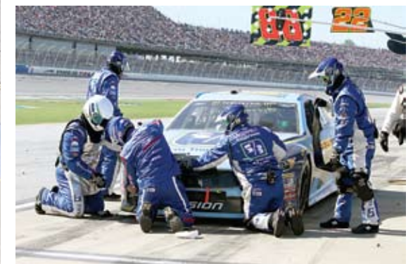
STENHOUSE CREW DID AWESOME JOB