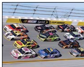
4 WIDE RACING