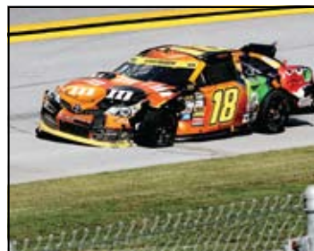
NO BUSCH IN FINAL 8