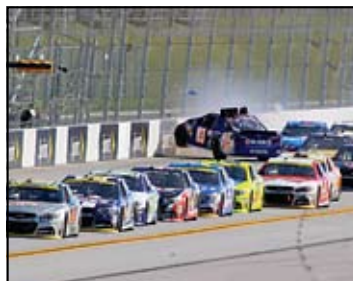
JJ YELEY AT LAP 103 GETS AIRBORNE