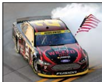
WICKED RUN BRAD!