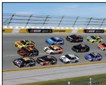
FINAL LAPS RACING