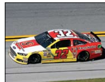
TERRY LABONTE LAST RIDE