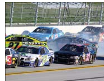
2ND BIG ONE-BYE BYE JR