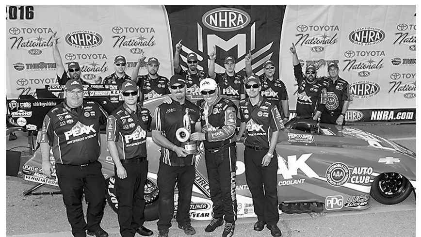
FORCE (PEAK RACINE CREW)