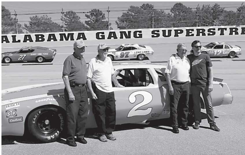
PAST AND PRESENT HISTORY ON TURN TWO AT DEGA

Allison Boulevard and Red Farmer Drive, and certain local businesses also have paid tribute to the famous drivers. A Honda automobile dealership located in Hueytown was named Neil Bonnett Honda for many years, but it was renamed Serra Honda in 2006. Additionally, the Seal of the City of Hueytown features two checkered flags, acknowledging the large part racing has played in the city's history. On April 30, 2014, Talladega Superspeedway renamed the back straightaway The Alabama Gang Superstretch.