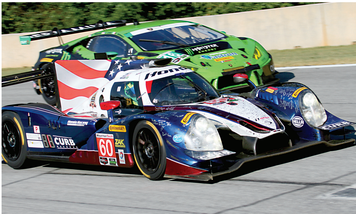
#60 THE TOOK WIN TO HELP HONDA TAKE MANUFACTURERS CHAMPIONSHIP