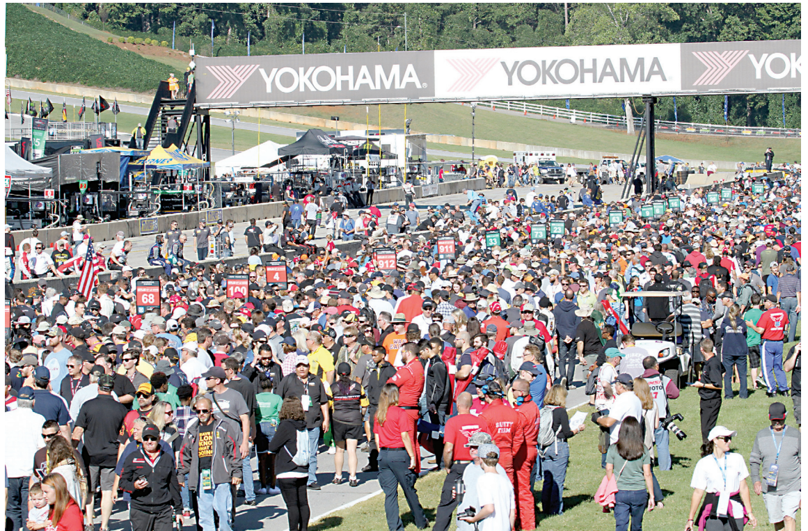
FANS WALK BEFORE THE START OF 1,000 MILES OF RACIN'!