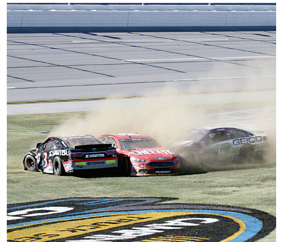
CHEEZE IT SQUEEZE