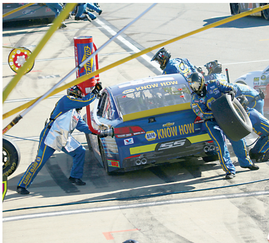
ELLIOTT PIT STOP