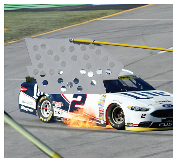
BYE BYE MOTOR