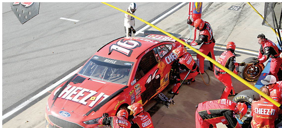
16 CREW KEPT BIFF IN THE RACE FINISHING 15TH