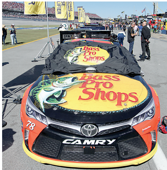
TRUEX JR STARTED ON THE POLE BUT ENDED UP 40TH

Also eliminated Sunday was Chase Elliott. Advancing are: Jimmie Johnson, Kevin Harvick, Matt Kenseth, Kyle Busch, Carl Edwards, Joey Logano and Denny Hamlin. There are four Toyota's remaining in the field, all from Joe Gibbs Racing. Stewart-Haas racing has Kurt Busch and Harvick- but the two had a heated exchange after the race over an alleged contact on the last lap- while Hendricks Motorsports has Johnson for three Chevrolets in the Field. Logano is the only Ford driver.