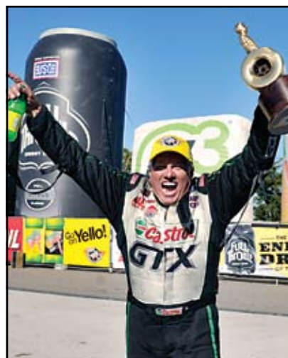
64 year old John Force celebrates like a young whippersnapper.