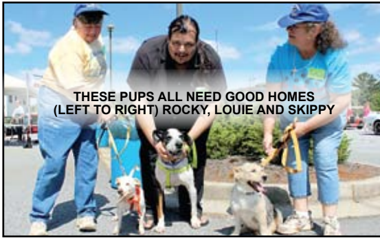
THESE PUPS ALL NEED GOOD HOMES (LEFT TO RIGHT) ROCKY, LOUIE AND SKIPPY