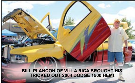
BILL PLANCON OF VILLA RICA BROUGHT HIS TRICKED OUT 2004 DODGE 1500 HEMI