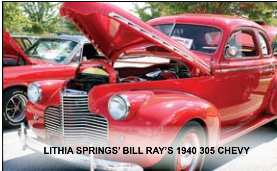
LITHIA SPRINGS' BILL RAY'S 1940 305 CHEVY