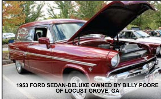
1953 FORD SEDAN-DELUXE OWNED BY BILLY POORE OF LOCUST GROVE, GA