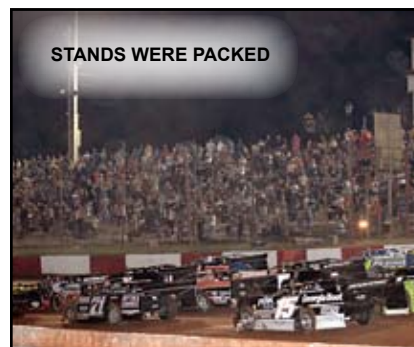
STANDS WERE PACKED