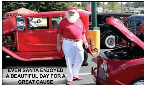
EVEN SANTA ENJOYED A BEAUTIFUL DAY FOR A GREAT CAUSE