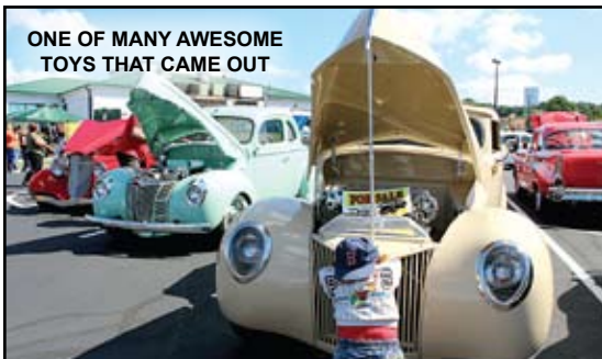
ONE OF MANY AWESOME TOYS THAT CAME OUT