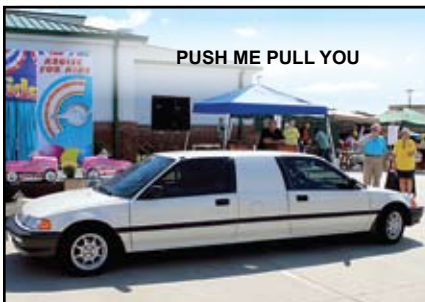
PUSH ME PULL YOU