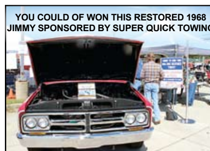
YOU COULD OF WON THIS RESTORED 1968 JIMMY SPONSORED BY SUPER QUICK TOWING