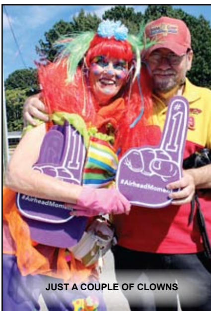
JUST A COUPLE OF CLOWNS