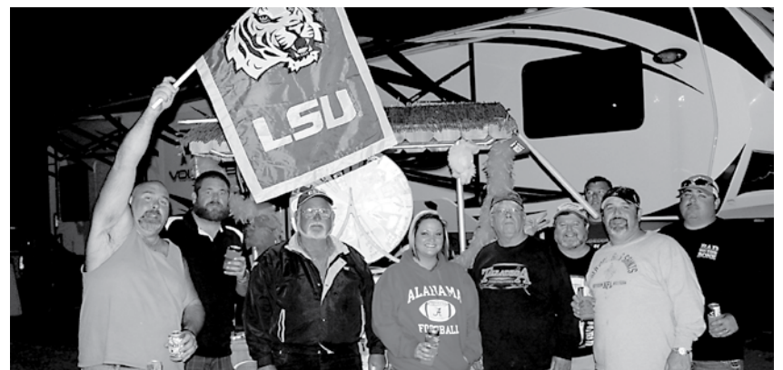
HAVING FUN IN THE INFELD. GO LSU!