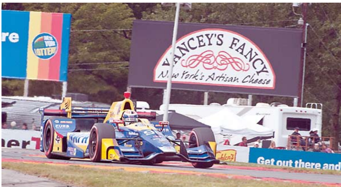
ROSSI MANUVERING THRU THE BUS STOP