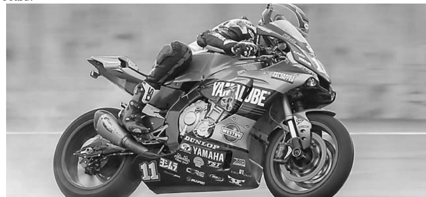
#11 ON THE WAY TO HIS FIRST WIN