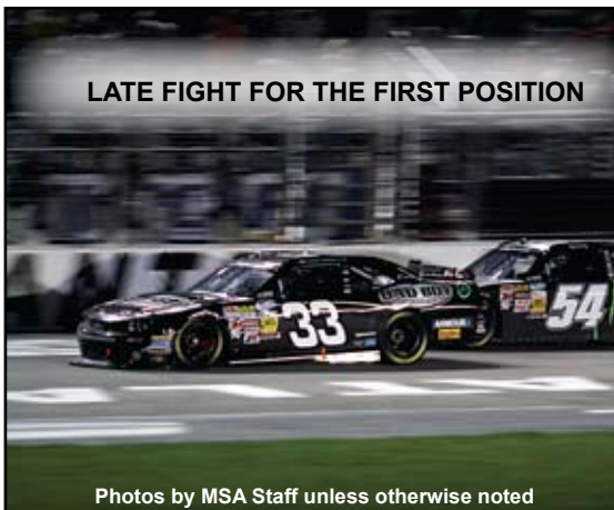
LATE FIGHT FOR THE FIRST POSITION