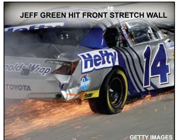
JEFF GREEN HIT FRONT STRETCH WALL