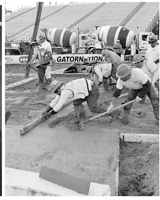
12 · DECEMBER/JANUARY 2019 · www.MotorsportAmerica.com