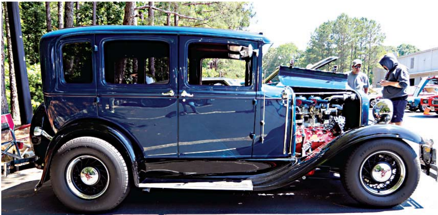
Car Shows display the history of auto styles and horsepower as they advanced through the early years.

See more photos on Page 9.