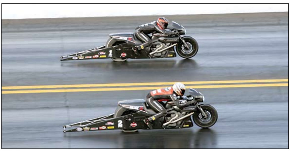
HARLEY'S STARTING 2018 WHERE THEY LEFT OFF IN 17