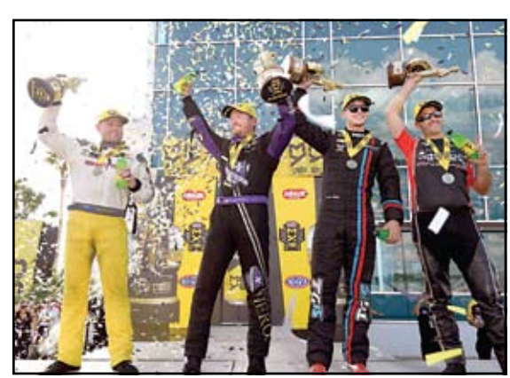
WINNERS CIRCLE-GAINSVILLE 2018