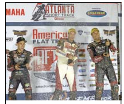
CELEBRATION FOR TWINS 1ST- 3RD