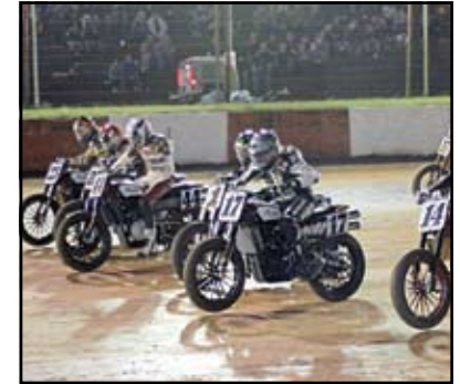
START OF AFT TWINS FINAL