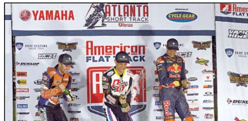
AFT SINGLES CELEBRATE