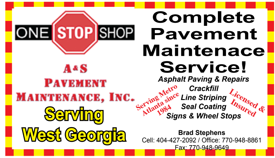
12 · MARCH / APRIL 2019 · www.MotorsportAmerica.com