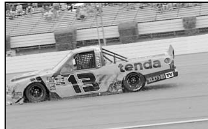
LAST YEAR'S TRUCK CHAMP SAUTER HAD ANOTHER BAD RACE BUT STILL FINISHED 8TH