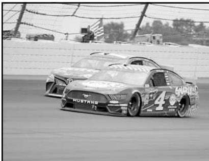
POLE WINNER HARVICK TAKING LEAD FROM KYLE BUSCH