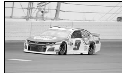
CHASE STARTED 23RD AND FINISHED 38TH