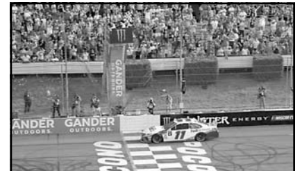
3RD CHECKER FLAG IN 2019