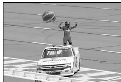
WATERMELON MAN CELEBRATING 3RD OFFICIAL WIN