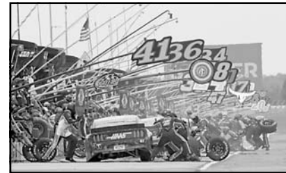
PIT ROW ACTION