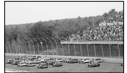
2 LAP SHOOT OUT HEADED TO TURN ONE