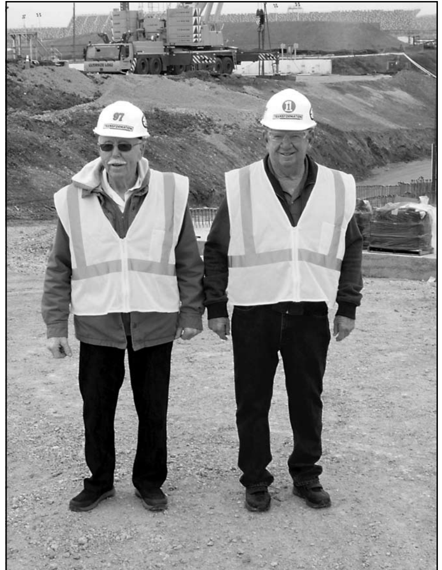
SPECIAL GUESTS RED FARMER AND DONNIE ALLISON