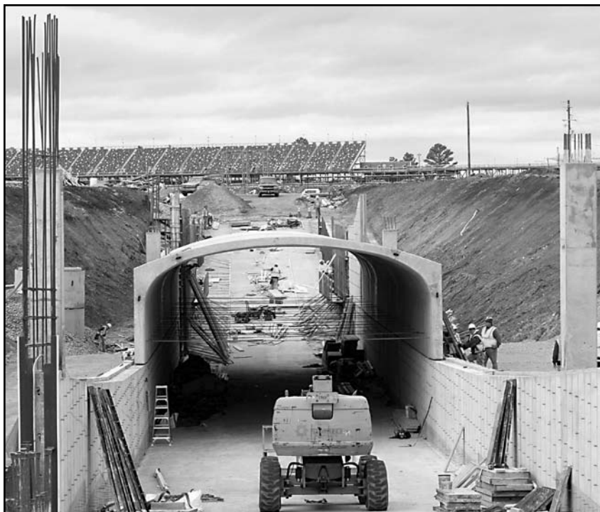
IT'S COMING TOGETHER