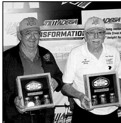
PIECES OF HISTORY