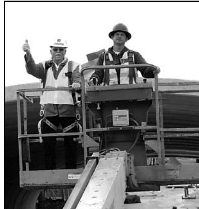
RED GIVE IT THUMBS UP!

This spring race will also feature a new Premium Finish Line RV Area along with new Infield shower trailers to make a better experience for infield campers. The new RV spots were almost all sold out at press time. The spring race is scheduled for April 26-28 and will include a Friday ARCA race, a Saturday Xfinity race and of course Sundays Big 500 mile Monster Energy Cup Series Race. See you at the Best RaceTrack in NASCAR.