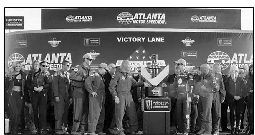
TWO FOLDS OF HONOR WINS IN A ROW