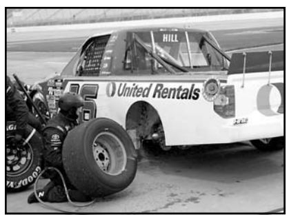
AUSTIN HILL GETTING SERVICE