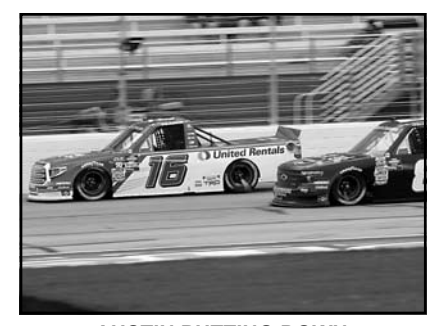
AUSTIN PUTTING DOWN #8 JOE NEMECHECK