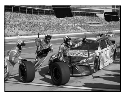
CANDY CREW AT WORK