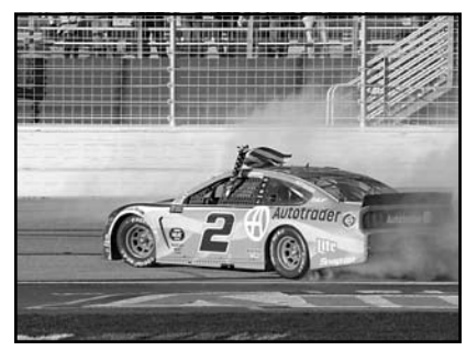
BRAD GIVES SALUTE TO OUR SOLDIERS AND COUNTRY