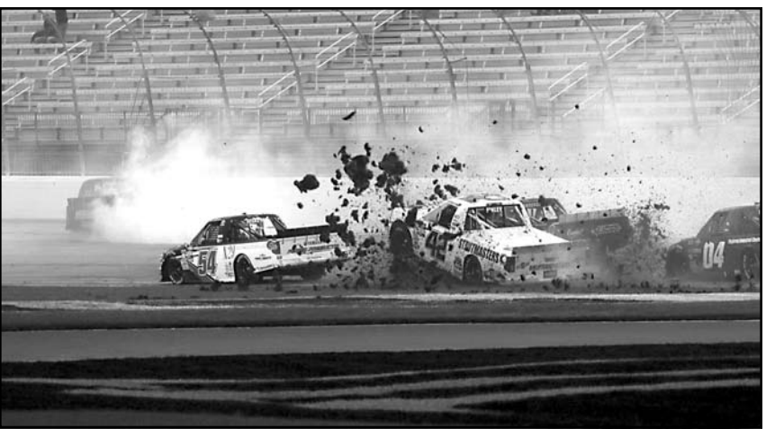
A LITTLE MISHAP GOING INTO TURN #1