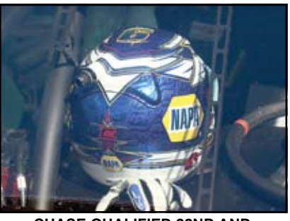
CHASE QUALIFIED 22ND AND FINISHED 19TH