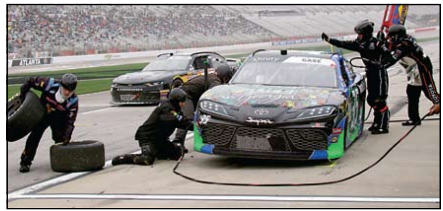
GASE PULLS IN HIS TOYOTA SUPRA

FEBRUARY / MARCH 2019 · www.MotorsportAmerica.com · 9