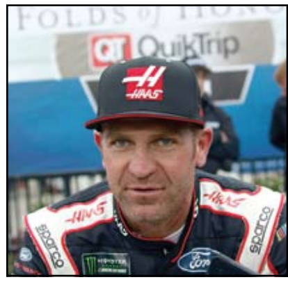
BOWYER ENTERTAINING MEDIA AFTER QUALIFYING 3RD