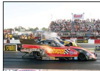
COURTNEY #1 QUALIFIER AND 10TH CAREER WIN