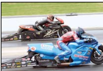
4 TIME SOUTHERN NATIONALS WINNER TOOK OUT SCOTTY FOR 45TH CAREER WIN