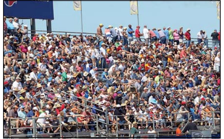
STANDS WERE FILLED ALL WEEKEND

The 2018 NHRA Mello Yello Drag Racing Series season continues with the Menards NHRA Heartland Nationals presented by Minties at Heartland Motorsports Park May 18-20 in Topeka, Kan.