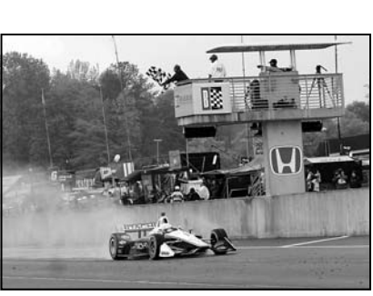
AND THE WINNER FINALLY-JOSEF NEWGARDEN