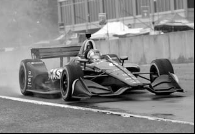
RAIN FINAL 10 LAPS