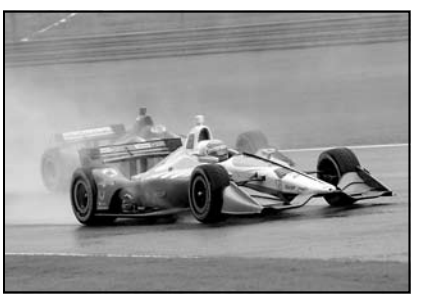
HARD TO PASS