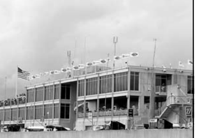
RAIN CLOUD'S LOOMING OVER BARBER MSP