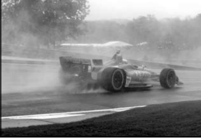
VERY FUZZY VIEW