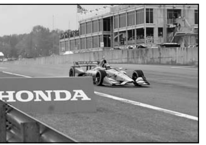
HUNTER REAY FINISHES-2ND