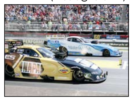
CAPPS TAKING OUT HIS TEAMMATE