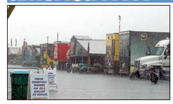
SATURDAY LATE AFTERNOON DRENCHING