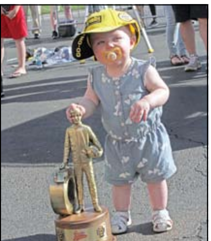
THIS IS MY WALLY