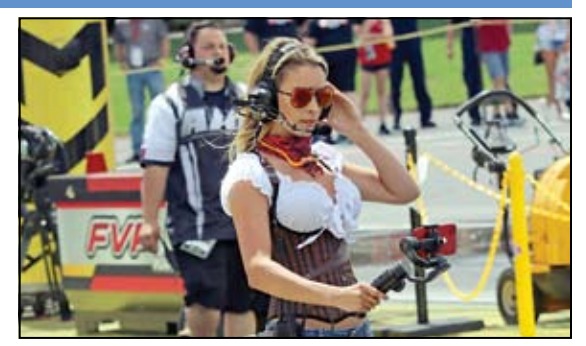
IT WAS ON BEAUTIFUL SUNDAY