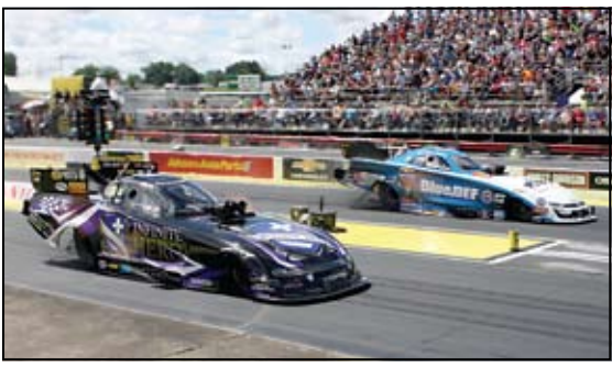
JOHN FORCE TOOK OUT FAST JACK IN ROUND 1