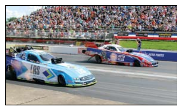
WILKERSON TOOK OUT HIGHT IN ROUND 3