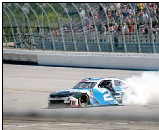
2018 XFINITY CHAMP CELEBRATES HIS 1ST WIN OF 2019