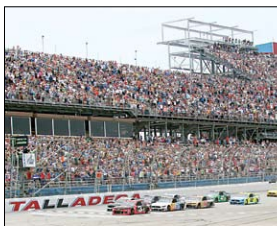
GEICO 500 START