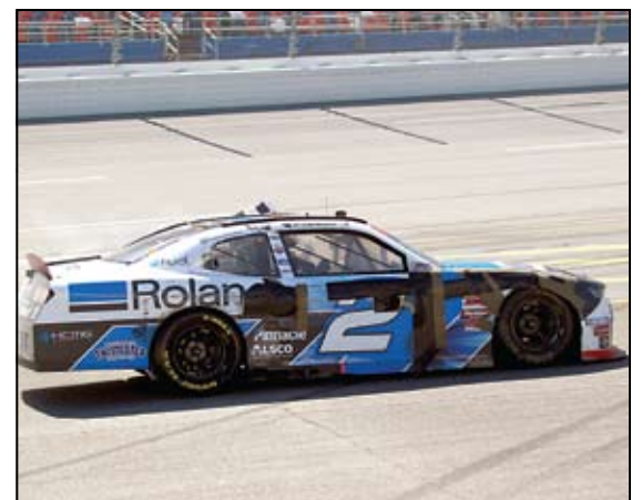
LOTS OF 200 MPH TAPE