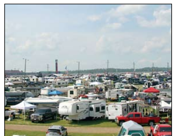
INFIELD WAS FULL