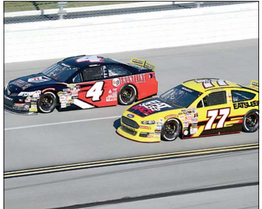
ARCA WINNER-#4 GILLILLAND AND #11 WILSON FIGHT FOR POSITION