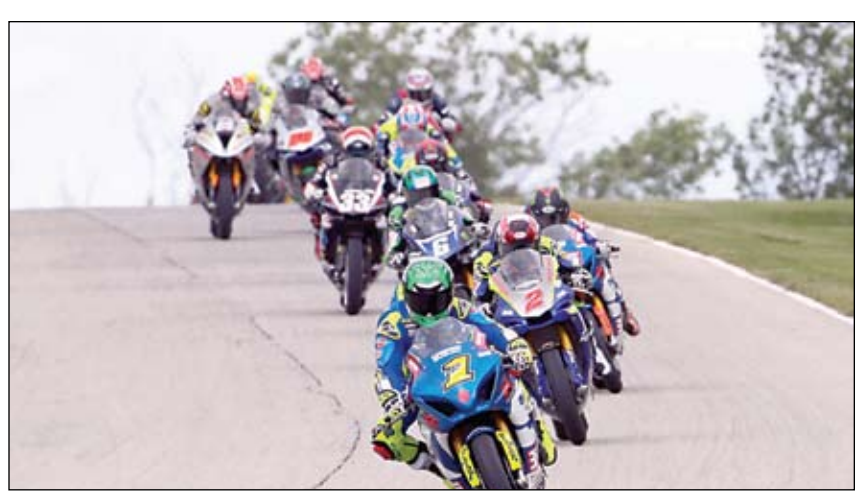
SUPERBIKE RIDERS ALL IN A ROW