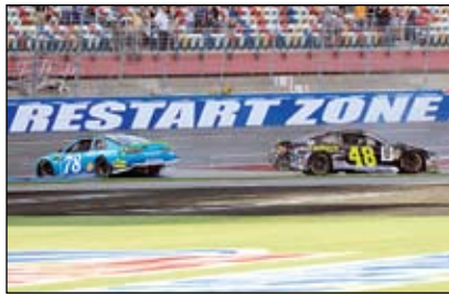
JIMMY QUOTE: EVERYONE