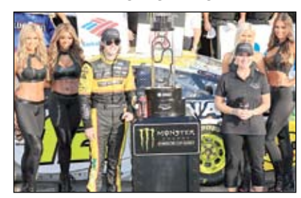
RYAN'S WIN PUTS ALL THREE OF PENSKE CARS INTO NEXT ROUND