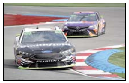
ALL FOUR OF TONY'S CAR MADE NEXT ROUND