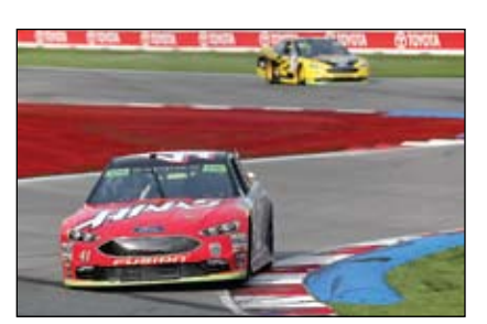
#41-KURT BUSCH STARTED ON THE POLE (NASCAR PHOTO)