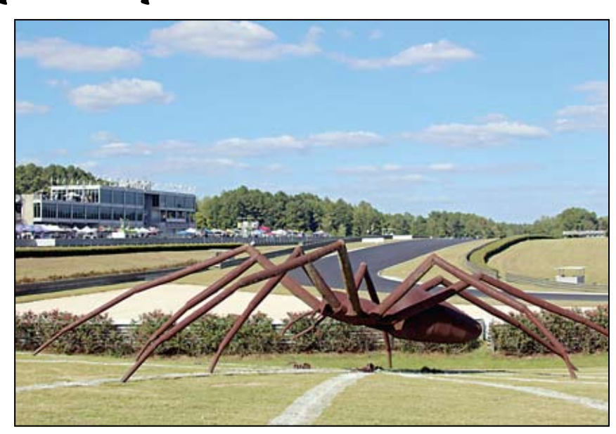
BARBER'S CHARLOTTE'S WEB TURN 5