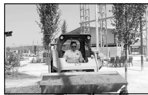
MOVING THE EARTH